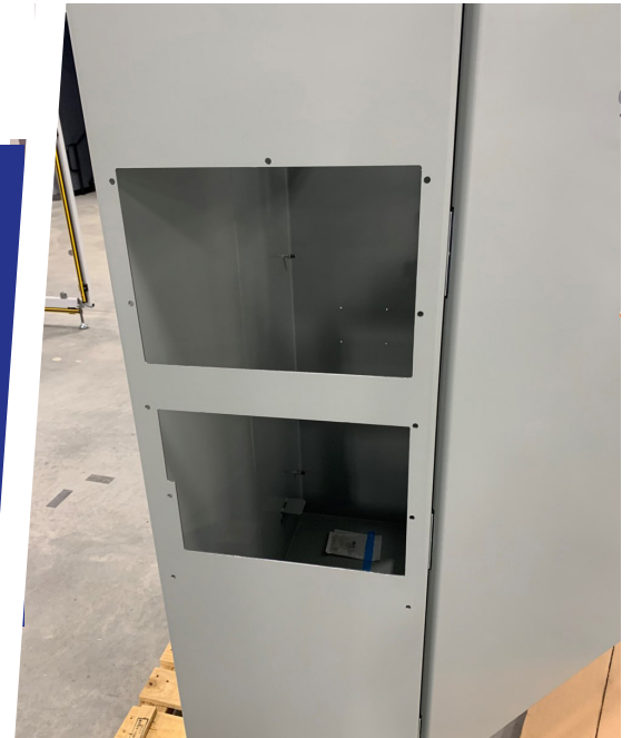
Complicated air conditioner cutout